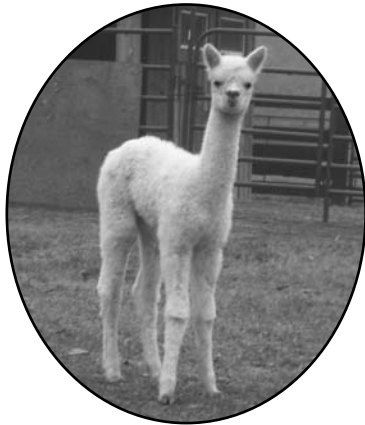
ELK Titan's Clash American Revolution

Happy is what we are about five of our herdsires being nominated for The Futurity Show to be held in April of 2008! The Double "O" Good Herdsire Hall of Fame males in the running for this prestigious event are Dom Lucilio, PPPeruvian Royal Fawn (co-owned with Maple Brook Alpacas), HDF Prince Phillip, ELK Hercules, and Snowmass Invincible (co-owned with Alpacas of Brookhollow Farm).